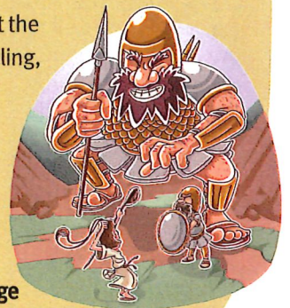
Bible story based on 1 Samuel 17

This was a day no-one would forget, when the courage of a shepherd boy saved a nation.